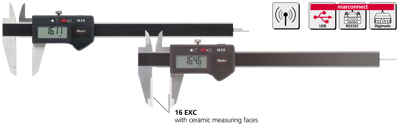
16 EXC with ceramic measuring faces